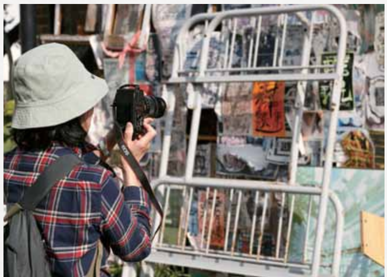
學員除用心攝影外，舊街坊更難得可以重遊舊地，重拾與社區的連繫。 Besides photo-shooting, participants who used to live in To Kwa Wan district are able to return to the old community and re-establish their connections with it.

To allow these photos taken by the participants to be shared with the neighbours of To Kwa Wan, the organiser has held an open street exhibition at the junction of Kai Ming Street and Wing Kwong Street in To Kwa Wan District (which is the site of URA's Kai Ming Street Redevelopment Project) from January to mid-May this year, displaying a collection of more than 80 works. Members of the local community were able to appreciate these ingenious photos on the exhibition panels as they walked pass, and enjoyed the distinctive scenery of To Kwa Wan captured with photographic eyes.