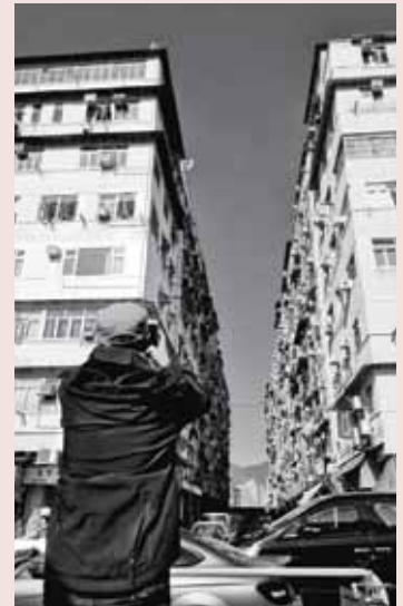
▲ 十三街 The Thirteen Streets