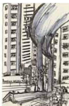
張家駿，山道天橋 Calvin Cheung, The Hill Road Flyover