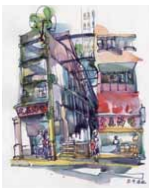
陸建邦，德輔道西 Ben Luk, Des Voeux Road West