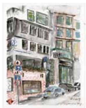
彭淑儀，蘇豪一隅 Agnes Pang, Somewhere in SOHO